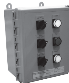
NEMA 4X Fiberglass Panel

The 97101P Local Control Panel can control up to 8 97101E units maximum. Selectors include Auto/Local Mode and Local Fill/Drain. Indicators show when the drip trap is filling or draining. An optional fail indicator is also available. Optional status and fail dry contacts for user control are available. The Local Control Panel is available for manual control only or with automatic timers. Typical enclosures available are NEMA 4X Fiberglass, 304 Stainless Steel, 316 Stainless Steel or NEMA 7 Aluminum.